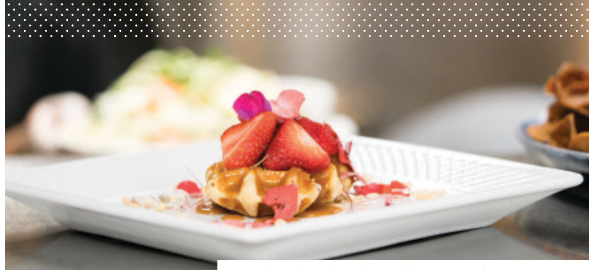
SERVE THE FRESHEST EXPERIENCE

Your clean eating deserves equally clean dinnerware. Serving your healthier ingredients on Libbey® dinnerware with exclusive Microban® technology supports a 99.9% cleaner surface. This powerful protective technology is featured on versatile Constellation™ dinnerware.