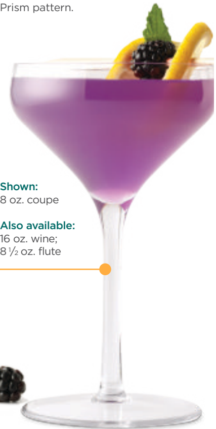
Shown: 8 oz. coupe