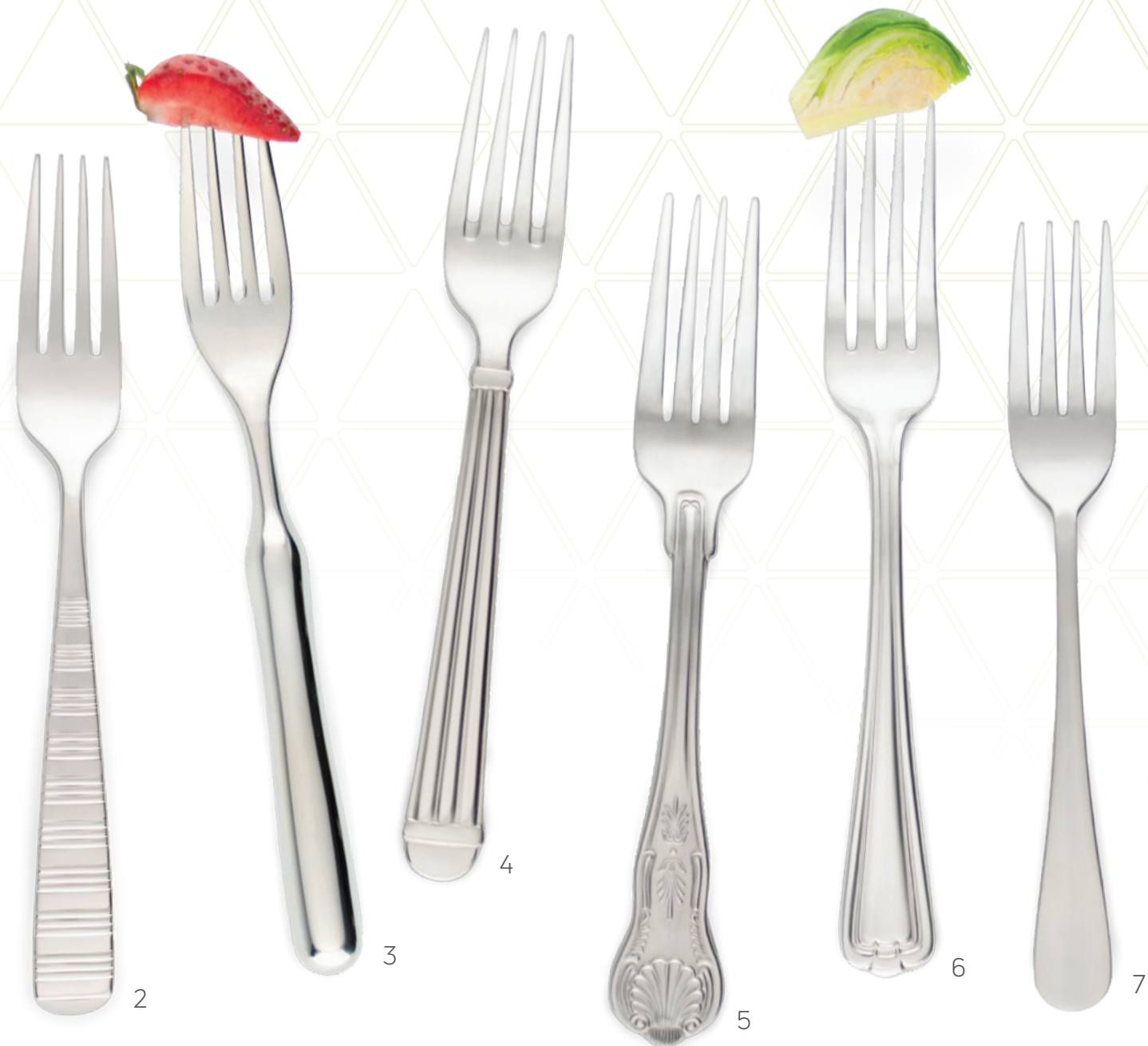
1. Equity 2. Galileo 3. Balencia 4. Aegean 5. Kings 6. Fairfield 7. Deluxe Windsor